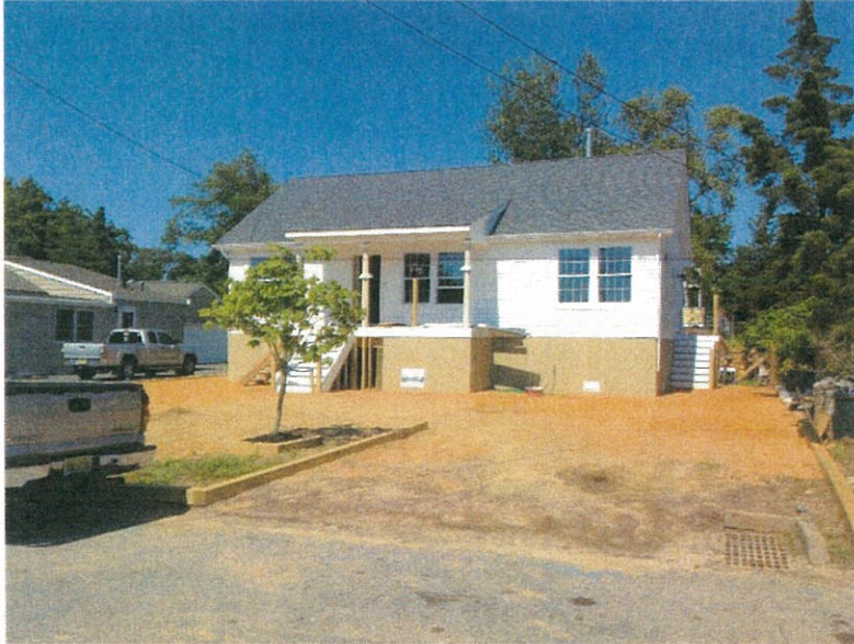
121 Bonita Road, Front, 08/25/14

If using the Elevation Certificate to obtain NFIP flood insurance, affix at least 2 building photographs below according to the instructions for Item A6. Identify all photographs with date taken; "Front View" and "Rear View"; and, if required, "Right Side View" and "Left Side View." When applicable, photographs must show the foundation with representative examples of the flood openings or vents, as indicated in Section A8. If submitting more photographs than will fit on this page, use the Continuation Page.