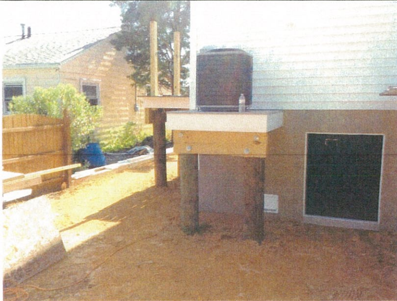
121 Bonita Road, A/C platform, 08/25/14

If submitting more photographs than will fit on the preceding page, affix the additional photographs below. Identify all photographs with: date taken; "Front View" and "Rear View"; and, if required, "Right Side View" and "Left Side View." When applicable, photographs must show the foundation with representative examples of the flood openings or vents, as indicated in Section A8.