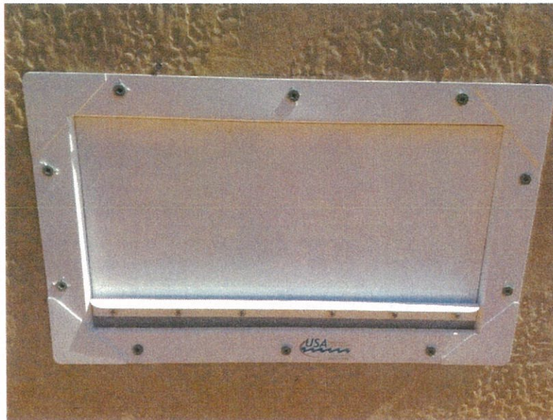
121 Bonita Road, Vent, 08/25/14