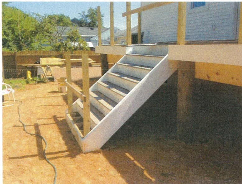
121 Bonita Road, rear, 08/25/14